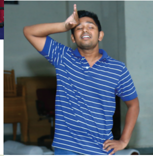
The Boxed Coin